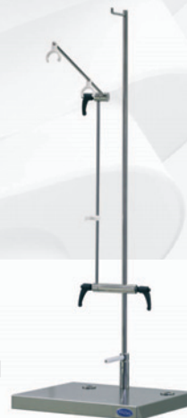
Table stand, adjustable height Made of stainless steel Catalogue code: PSDS