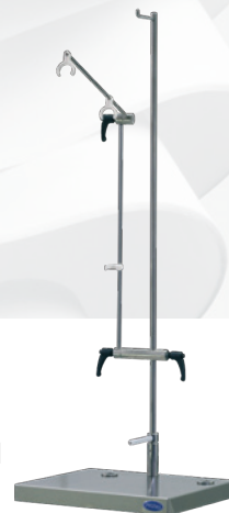
Table stand, adjustable height Made of stainless steel Catalogue code: PSDS